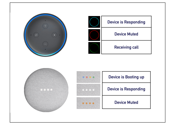
Figure 1: Amazon Echo Dot with the light ring and Google Home Mini with the LED lights along with a sample of their light behaviors. Total no. of light behaviors in Echo Devices: 12; Total no. of light behaviors in Google Home Devices: 17

Scenario: You initiate a new interaction with your google home device using the "Hey, Google" or "Ok Google" and the following light pattern appears.