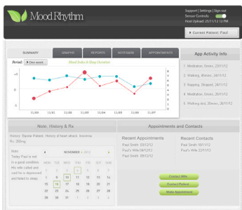
Figure 4. MoodRhythm's web dashboard, designed to help clinicians review rhythmicity data together with bipolar patients.

MoodRhythm's web dashboard (Figure 4) supports clinical decisions and helps accelerate patients' personal learning. Clinicians can gain a richer picture of a patient's routine and daily sleep and wake environment